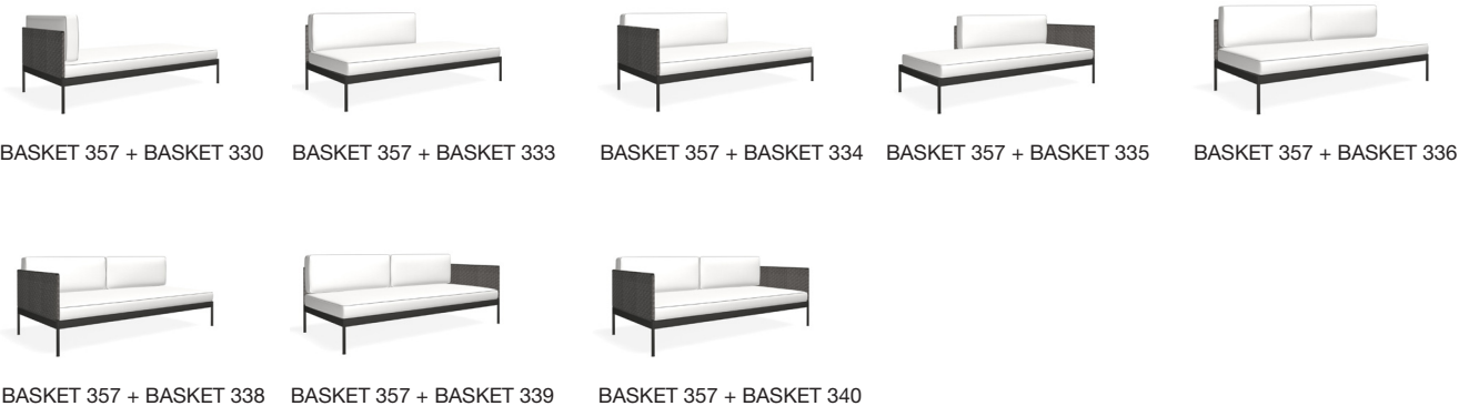
BASKET 357 + BASKET 330