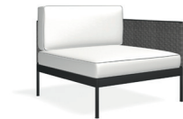
BASKET 350 + BASKET 331