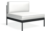
BASKET 350 + BASKET 330